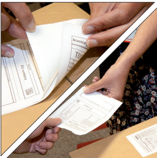
Peel and apply a delivery label leaving the corresponding invoice (or picking list, return policies and procedure, customer survey, etc.) printed on its backing paper.

The DB-EA4D is available with paper roll holder options, further enhancing the flexibility and range of applications for printing. With Bartender as standard and the option to download enhanced software, the user can easily design the label to meet the requirements of the business.