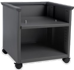
Adjustable Printer Stand